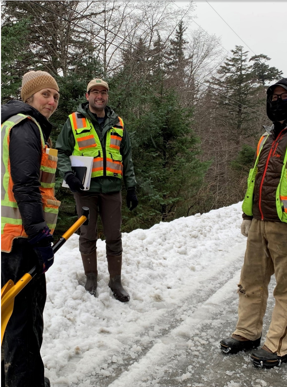
Thane project team on site visit