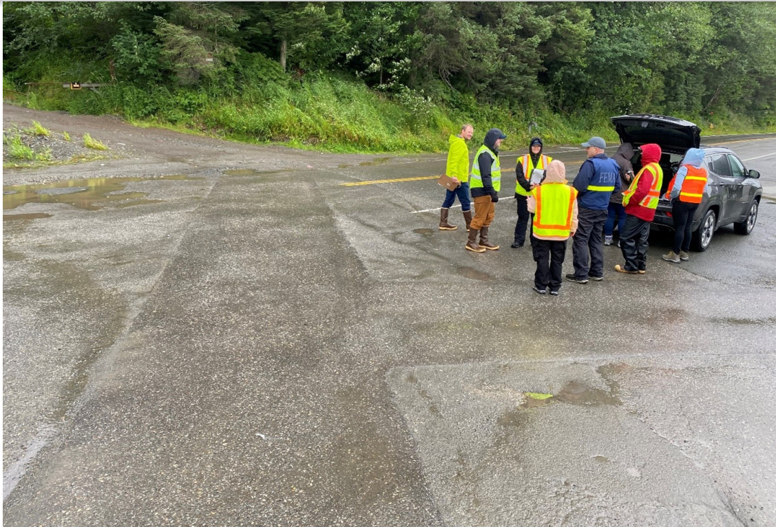
Project team discussing road damage sites in the field in Juneau.