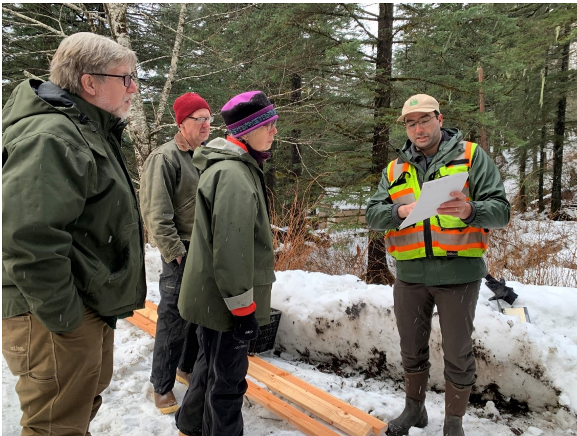
Thane project team on site visit discussing site plans with potentially affected homeowners