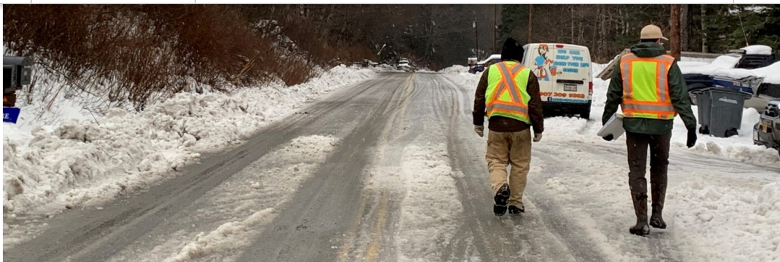
Thane project team on site visit